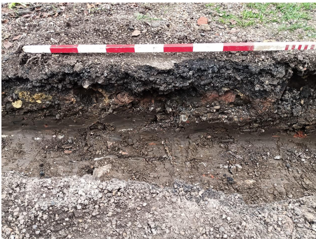
Plate 6. Typical yard section