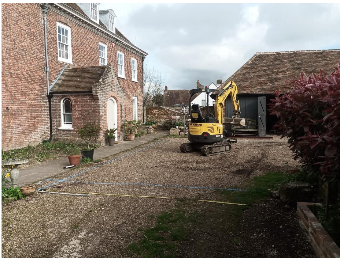
Plate 2. Setting out (Looking North)