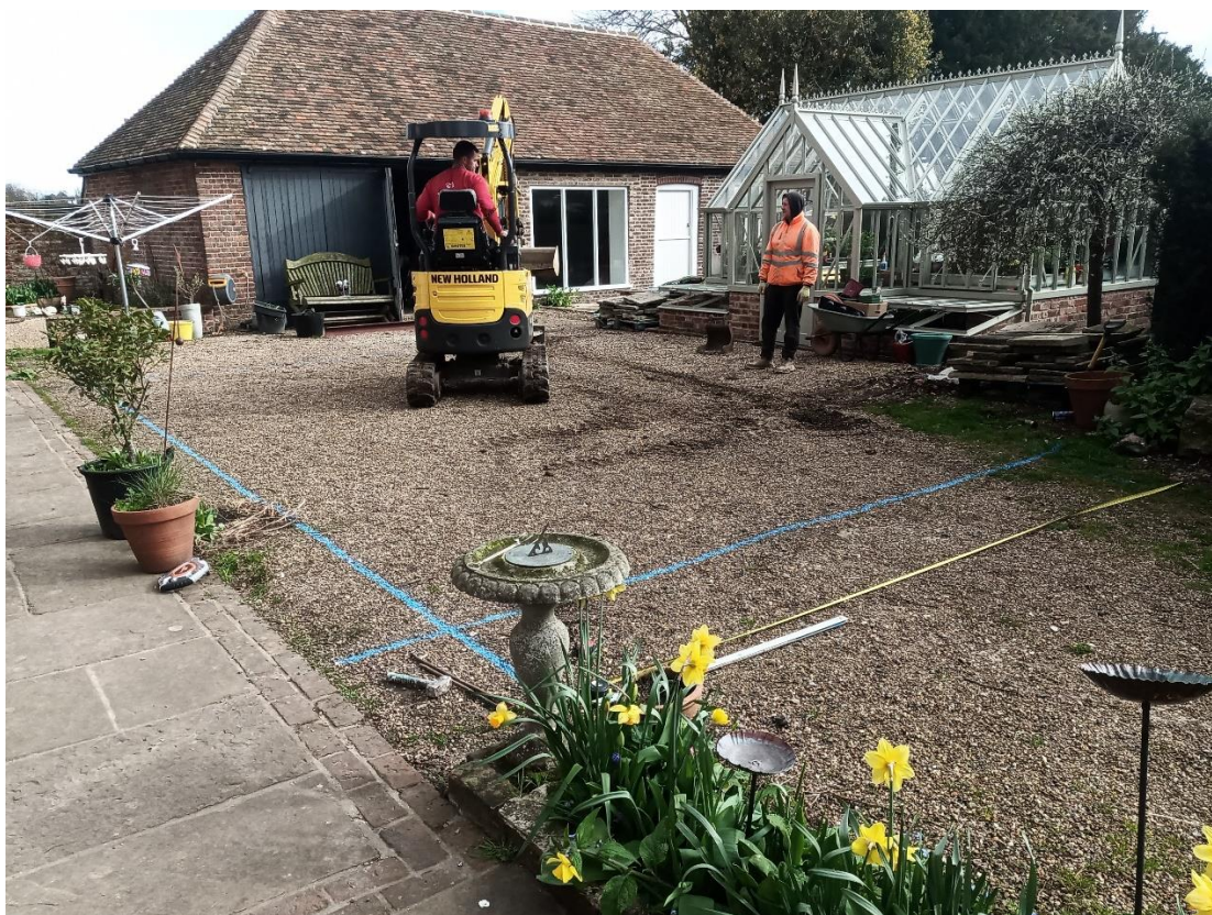
Plate 1. Setting out (Looking NNE)