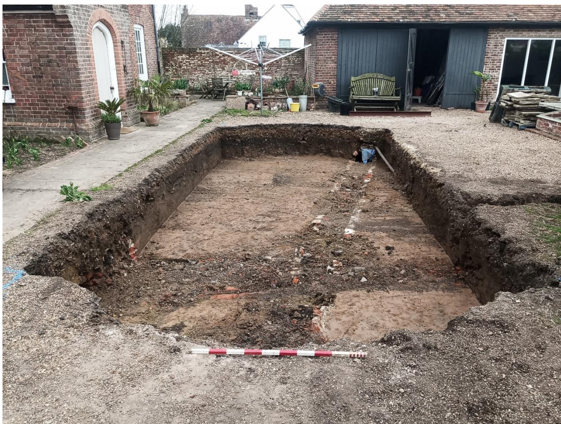
Plate 5. Completed excavation for pond (Looking North)