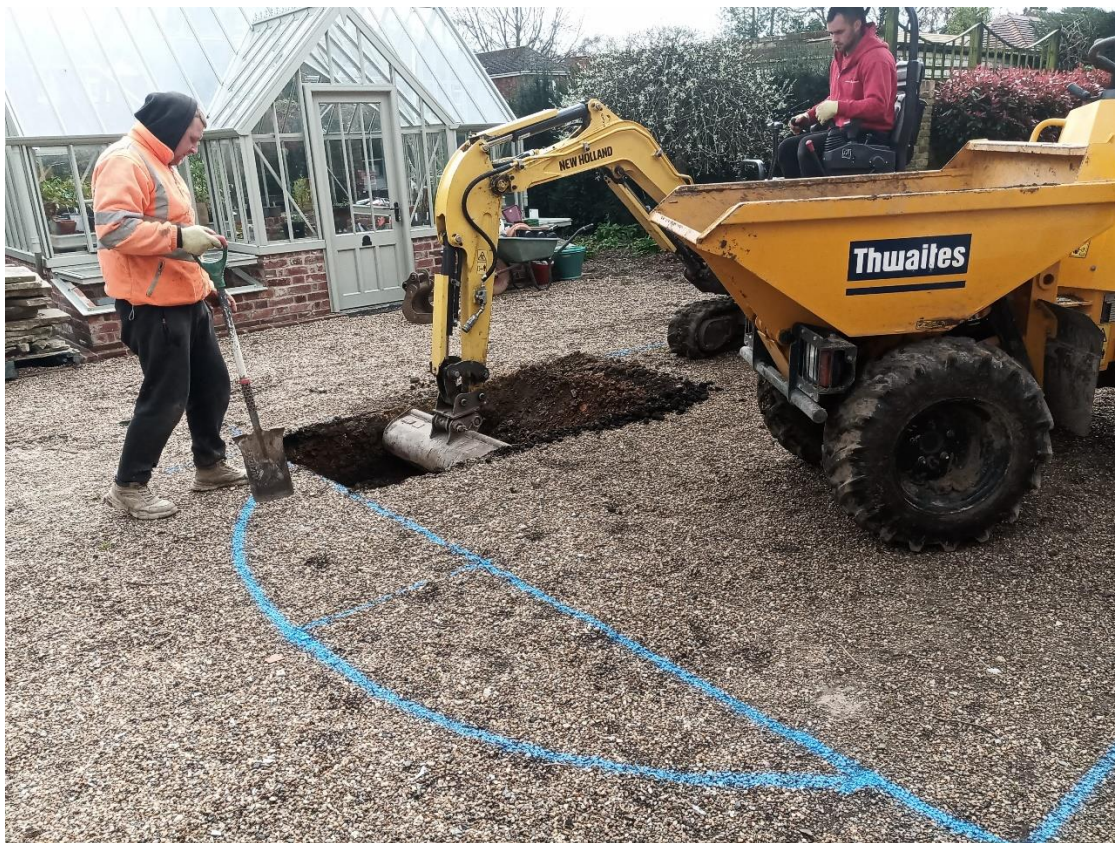
Plate 3. First groundworks (Looking SE)