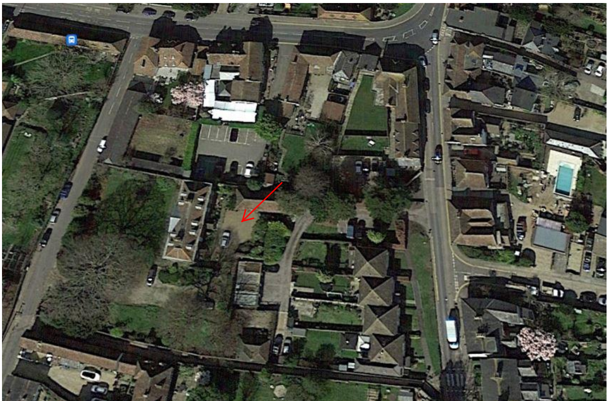
AP 2003 School Lane Wingham