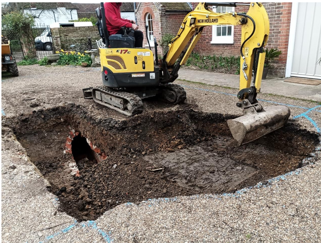
Plate 4. Initial ground reduction for pond (Looking SE)